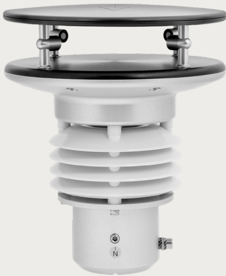
u[sonic]WS6 For six weather parameters