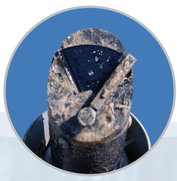
Despite significant bio-fouling after a 12 month deployment, the optical face of the DTS-12 is clean and perfectly operational.

The DTS-12 is the first sensor to make turbidity monitoring practical. The value of continuously monitoring turbidity has long been accepted, but it's always been difficult, inaccurate, expensive, labor-intensive, and therefore often dismissed as too impractical. The DTS-12 is different—we state with confidence that it's the "world's best" because its unique design delivers extremely low maintenance (just clean and re-calibrate once a year) and extremely high accuracy over the full measurable range of 0-1,600NTU. Unlike multisondes, the DTS-12 does one task, but does it exceptionally well and it is also less expensive and simpler to deploy.