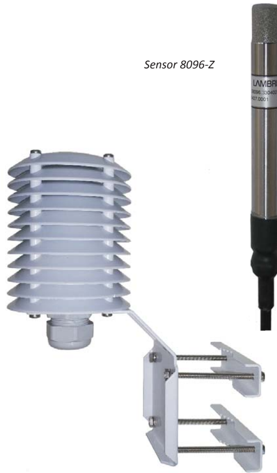
Sensor shelter (accessory)